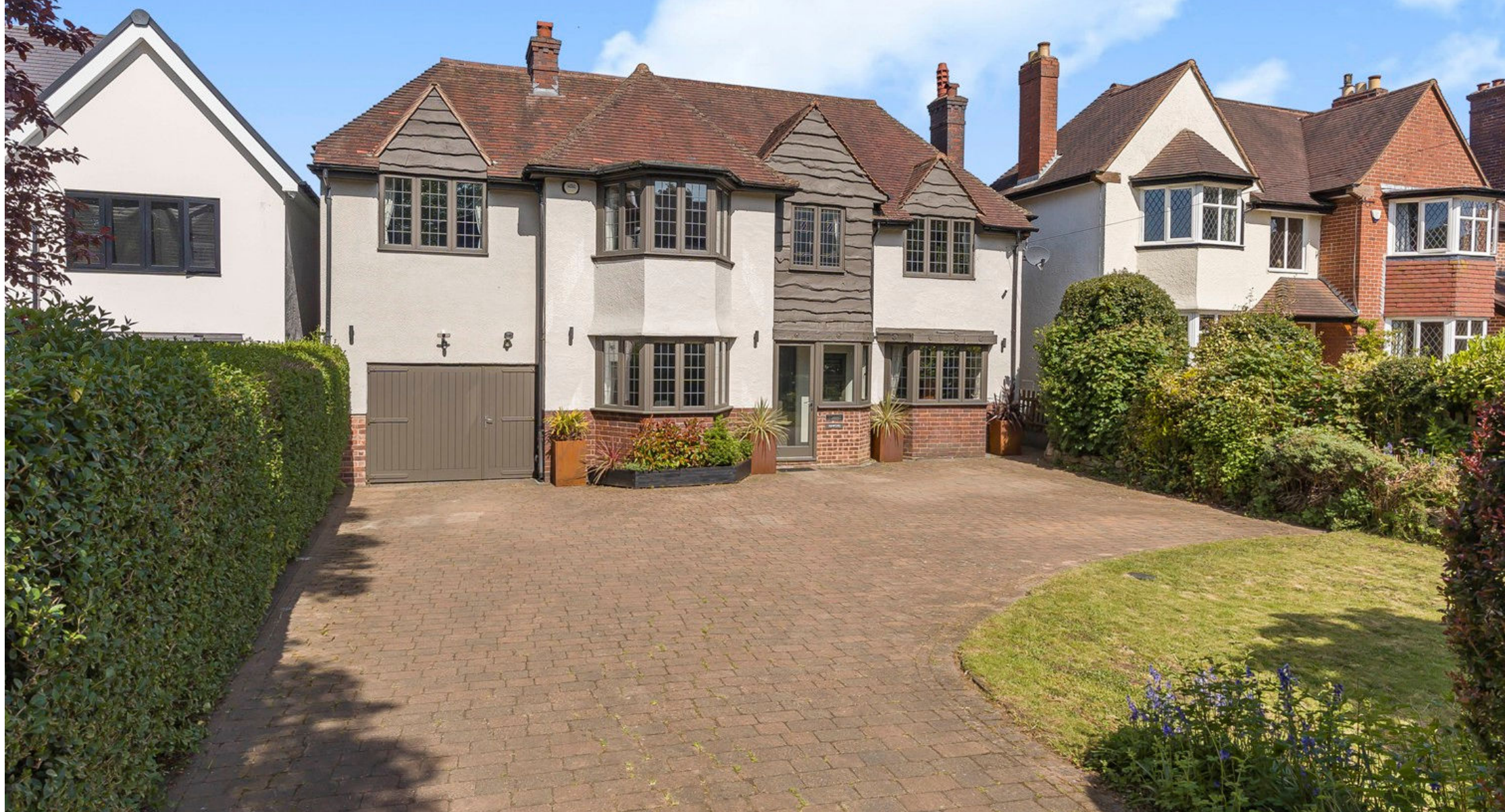
ASHFORD, 17 CROWN LANE, FOUR OAKS, B74 4SU